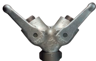
1" - 1½"