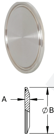
Schedule 5S and 10S Solid End Caps - 16AMV