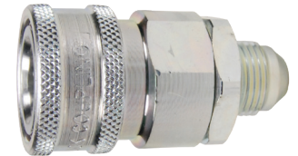
steel - JIC