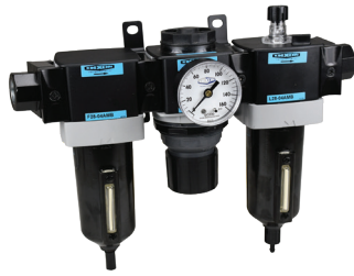
with metal bowl