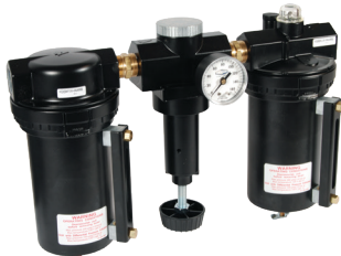
with metal bowl